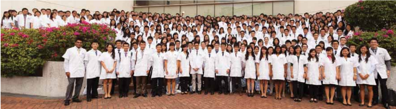
Clockwise from top:

Yong Loo Lin School of Medicine, Class of 2017 • The Class of 2017 reciting the Medical Student's Pledge • Messages of encouragement and blessings from proud parents, friends and caring seniors.